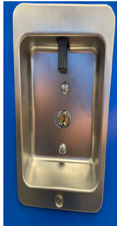
BUILT-IN KEY LOCK