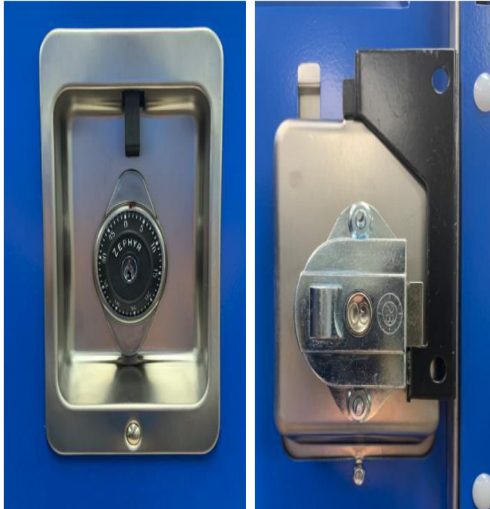
BUILT-IN COMBINATION LOCK