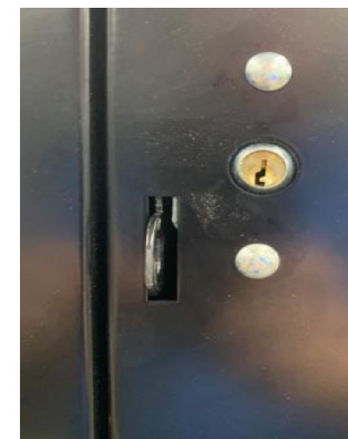
BUILT-IN KEY LOCK