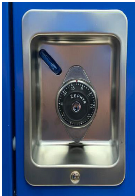
BUILT-IN COMBINATION LOCK