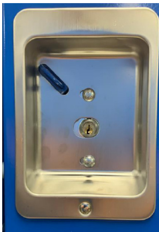
BUILT-IN KEY LOCK